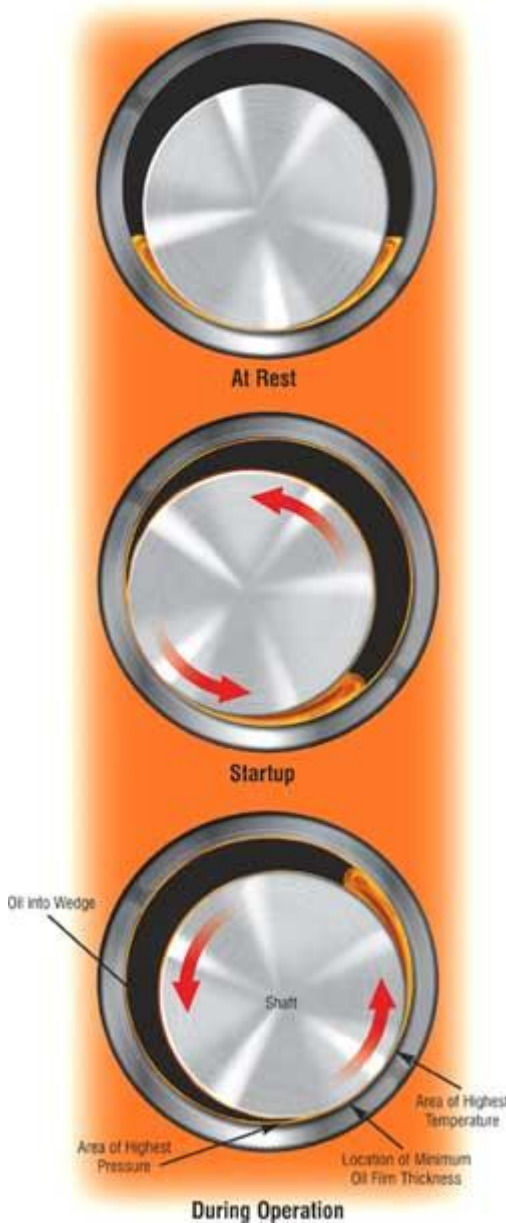
Figure 3. Shaft Motion During Startup

Normally, the minimum oil film thickness is also the dynamic operating clearance of the bearing. Knowledge of the oil film thickness or dynamic clearances is also useful in determining filtration and metal surface finish requirements. Typically, minimum oil film thicknesses in the load zone during operation ranges from 1.0 to 300 microns, but values of 5 to 75 microns are more common in midsized industrial equipment. The film thickness will be greater in equipment which has a larger diameter shaft. Persons requiring a more exact value should seek information on the Sommerfeld Number and the Reynolds Number. Discussion of these calculations in greater detail is beyond the scope of this article. Note that these values are significantly larger than the one-micron values encountered in rolling element bearings.