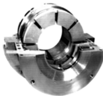
Figure 1. Kingsbury Radial and Thrust Pad Bearing

Tilting-pad or pivoting-shoe bearings consist of a shaft rotating within a shell made up of curved pads. Each pad is able to pivot independently and align with the curvature of the shaft. A diagram of a tilt-pad bearing is presented in Figure 1. The advantage of this design is the more accurate alignment of the supporting shell to the rotating shaft and the increase in shaft stability which is obtained. 1 An article on tilting-pad bearings appeared in the March–April 2004 issue of Machinery Lubrication magazine.